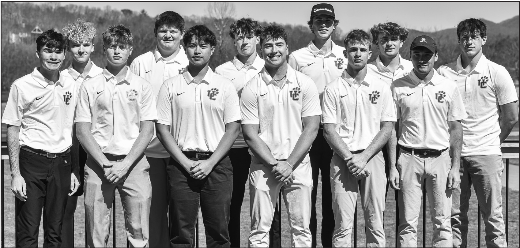
The Union County men's golf team were one shot out of third place after round one of last week's State Championships at Bull Creek East Golf Course in Midland.